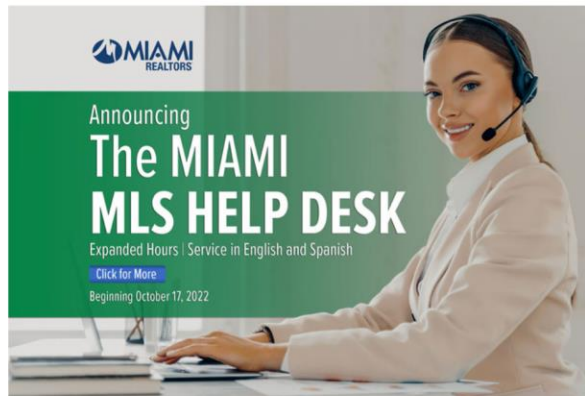
The MIAMI MLS HELP DESK

Our MIAMI Professional Staff are ready to assist you with all your MLS and Matrix questions.