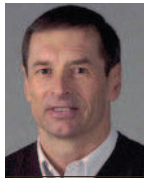
James Duiley Sensible Home

Question: Based on our water bills, my family uses lots of water and much of it is probably hot water. Is there a simple solar hot water system design that I could build myself?