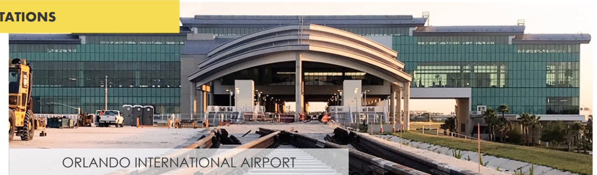
ORLANDO INTERNATIONAL AIRPORT