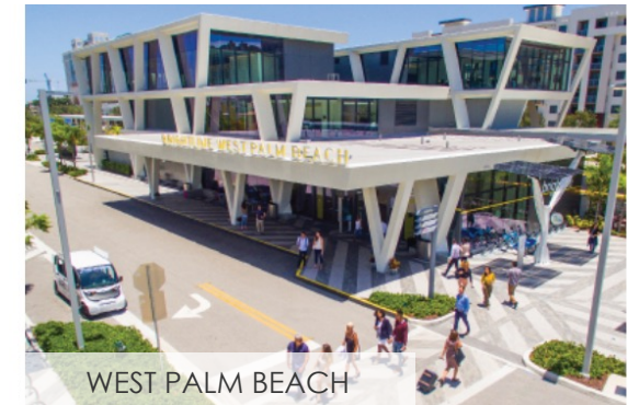
WEST PALM BEACH