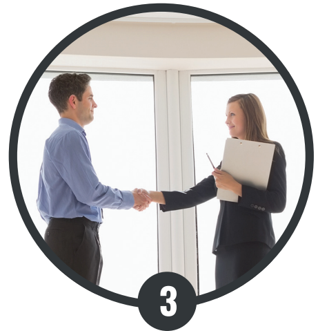
3 KNOW YOUR PROSPECT