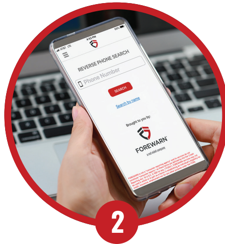
2 CHECK THE FOREWARN APP