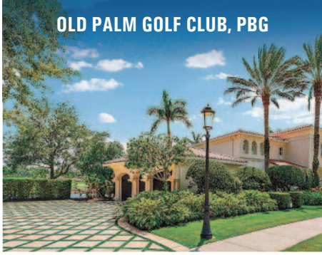
4BR/4.1 BA | 5,233 SF | $4,950,000 VIEWS TO CLUBHOUSE AND 18TH HOLE