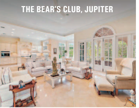
4 BD/4.1 BA | 5,629 SF | $8,995,000 1 ACRE LOT ON THE PRESERVE