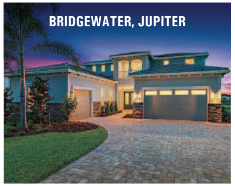
5 BR/6 BA | 4,323 SF | $2,698,000 .95 ACRE | NEW DIVOSTA HOME