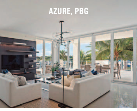
4 BR/ 4.1 BA | 3,839 SF | $4,495,000 HUGE PATIO | ALSO AVAIL FOR LEASE