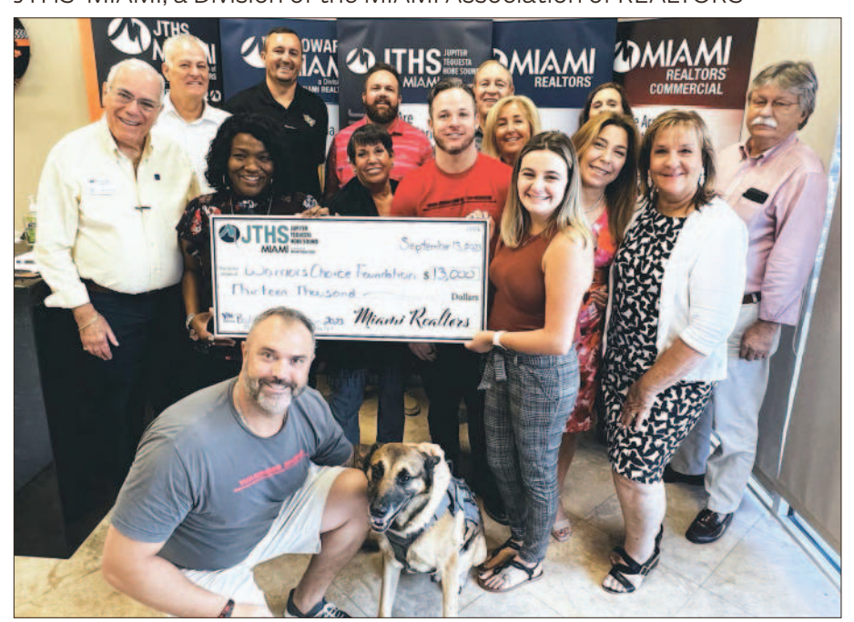
Check presentation to Warriors Choice Foundation.