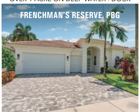
4 BR/3.1 BA | 3,600 SF | $2,350,000 RENOVATED | COURTYARD HOME W/ POOL