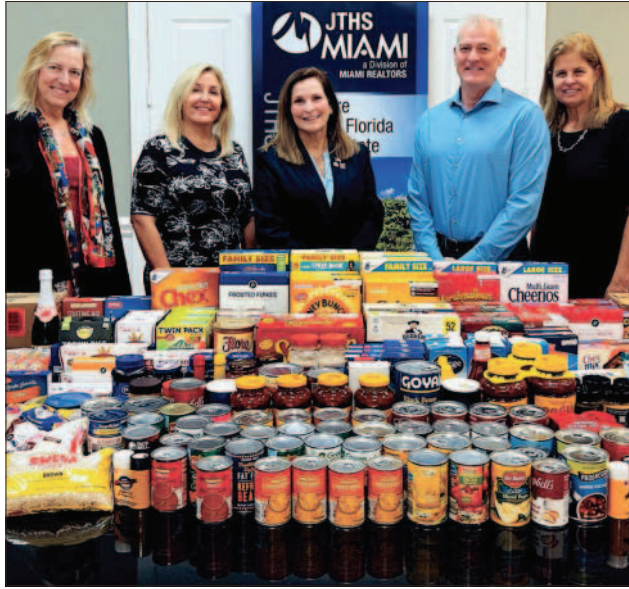
Food donation is one of many local initiatives JTHS-MIAMI has conducted throughout the years.

The Jupiter-Tequesta-Hobe Sound Council of the MIAMI Association of Realtors (JTHS-MIAMI) recently donated more than $20,000 worth of food and personal items to El Sol, Jupiter's Neighborhood Resource Center that provides essential services primarily to day laborers, their children, and families.