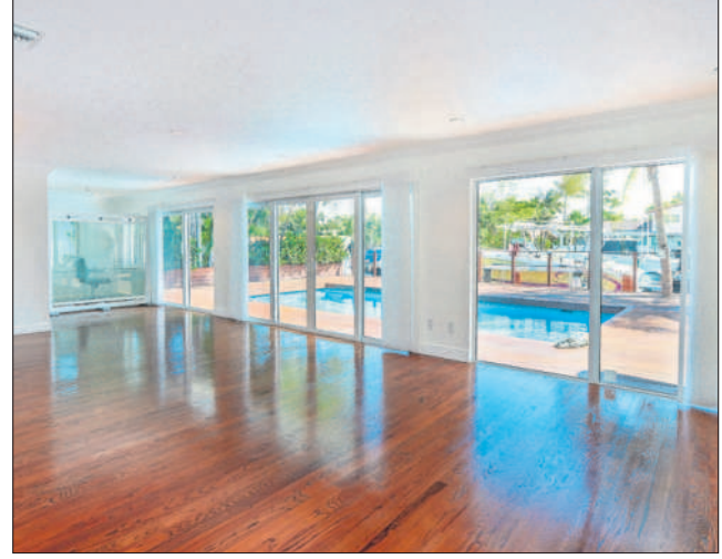
Large expanses of glass fill living spaces with natural light.

generous living spaces with natural light. Two granitetopped islands — one with a double sink and snackbar seating, the other with cooktop and range hood anchor the spacious kitchen,